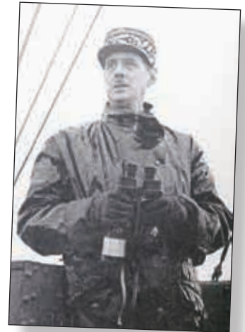
de Gaulle in MTB 94

Jersey achieved a further success resulting in special awards of the Ordre de l'Armée. These, a uniquely French decoration bestowed on the boat, were presented by de Gaulle himself, whose son Philippe was First Lt of one of them. During the invasion this flotilla guarded the western flank and later on were the first craft to enter Brest. In all operations they completed 451 patrols and earned one DSO, five DSCs and six DSMs.