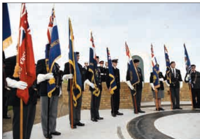
Standards at Newhaven

Please advise the Director (07740 243963) if you intend to come to either event.