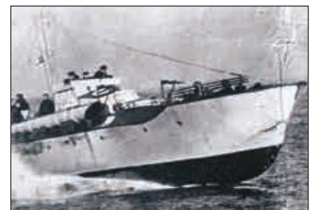
MTB 1939 Vosper 71ft (17ft beam)