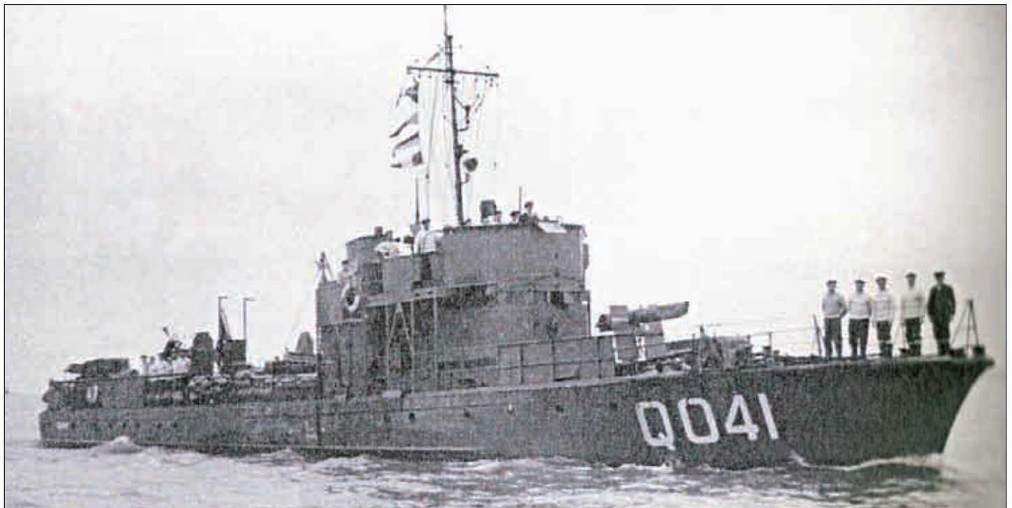
Free French Chasseur

Meanwhile, several other groups of chasseurs which had arrived early in the war had assisted in the evacuation from Dunkirk, and then were initially based in Portsmouth, later moving to Cowes. Each was allocated a British liaison officer and telegraphist. Generally steel-hulled with a crew of 38, these 130 ton diesel boats carried five guns of up to 75mm calibre, plus depth charges and, latterly, RN-fitted Asdics. In the Solent, they not only earned the gratitude of the people of Cowes with their anti-aircraft prowess, but also provided the permanent seaborne defence patrol off St Helen's Fort as back-up to the boom defences and to deter possible midget submarine attacks. They also took part in the raids on Bruneval and Dieppe. Otherwise their duties involved general