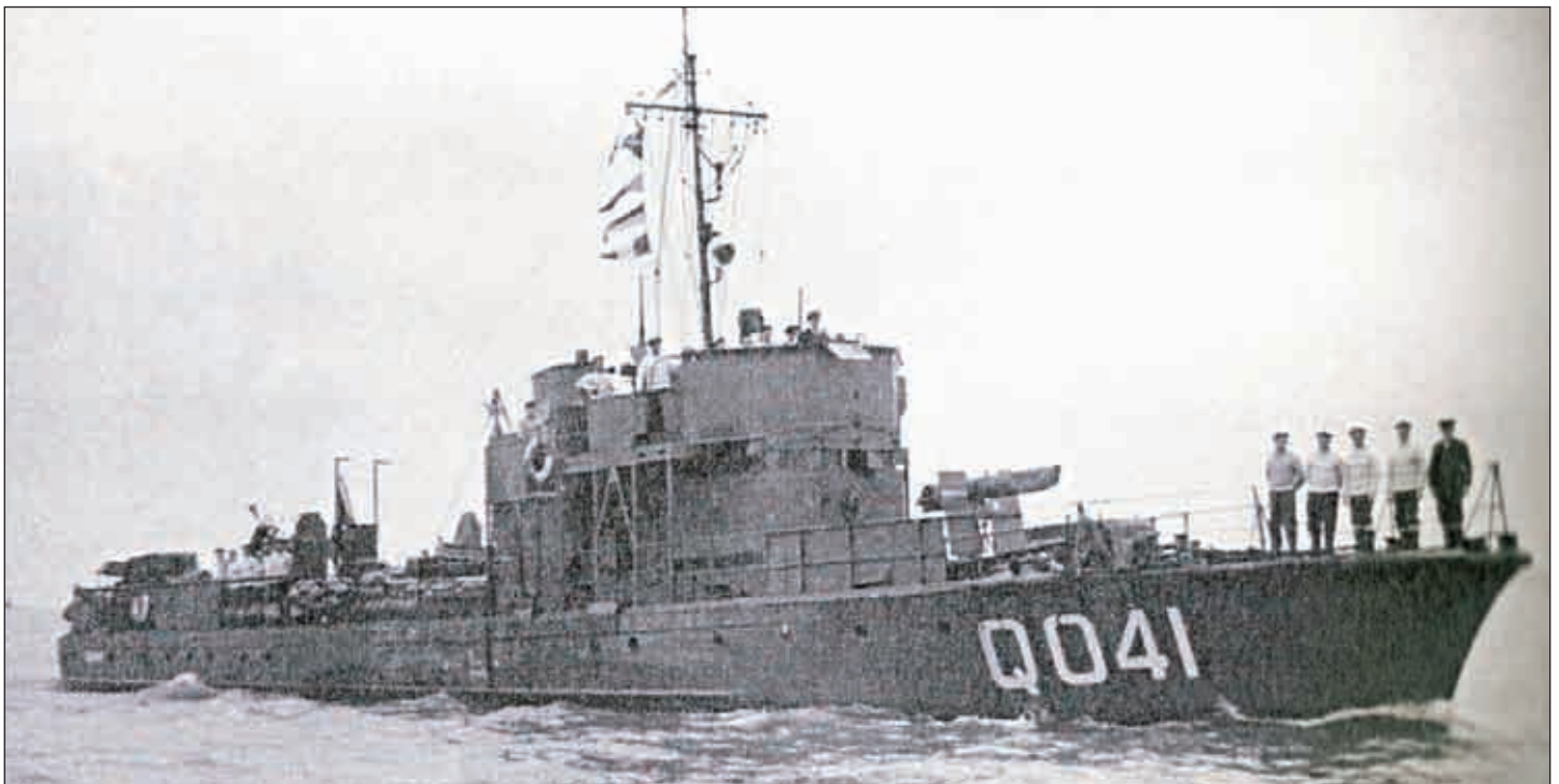
Free French Chasseur

Meanwhile, several other groups of chasseurs which had arrived early in the war had assisted in the evacuation from Dunkirk, and then were initially based in Portsmouth, later moving to Cowes. Each was allocated a British liaison officer and telegraphist. Generally steel-hulled with a crew of 38, these 130 ton diesel boats carried five guns of up to 75mm calibre, plus depth charges and, latterly, RN-fitted Asdics. In the Solent, they not only earned the gratitude of the people of Cowes with their anti-aircraft prowess, but also provided the permanent seaborne defence patrol off St Helen's Fort as back-up to the boom defences and to deter possible midget submarine attacks. They also took part in the raids on Bruneval and Dieppe. Otherwise their duties involved general