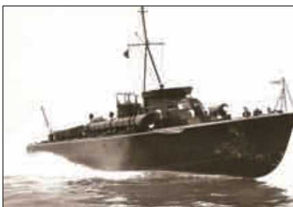
MTB 1938 Vosper 70ft

The section entitled SUPPORTERS' CORNER has been enlarged to include FEEDBACK. So it will now report some interesting re-actions and messages sent in as a result of previous articles. There have been some queries as to the year given for the Class Identification pictures featured on the front page in each Issue. In fact, the date shown is the year in which that class was ordered by the Admiralty, so of course that will usually be earlier than the time when the boats first appeared at sea.