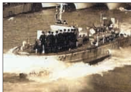
MTB 1938 Thornycroft 72ft