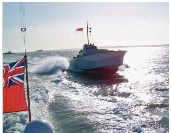
MTB 81 arrives at Portsmouth

Our last Newsletter reported that negotiations for the purchase of MGB 81 were progressing well but were still at a sensitive stage. We can now report that the purchase has been completed with funding principally from the National Heritage Memorial Fund but with a substantial contribution from our Trust. The boat is now owned by the Portsmouth Naval Base Property Trust and it is currently on display at Gunwharf Quays, Portsmouth. It will remain afloat and will appear at maritime events where appropriate. The boat does not currently have all its upper-deck fittings and weapons, so action is in hand to rectify this situation. Replicas of the principle weapons are being produced by MOD apprentices at QinetiQ, Boscombe Down. The Coastal Forces Heritage Trust supported the activity leading up to the purchase and the Trust is assisting in its management and the fitting-out of the weapons.