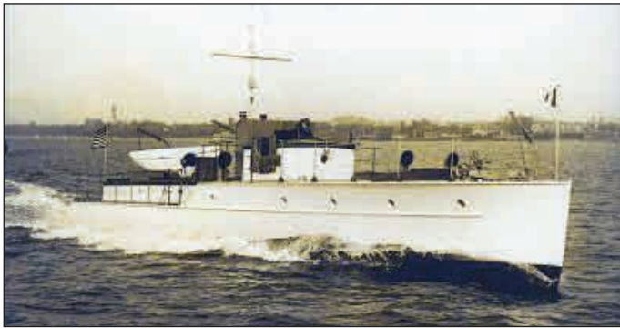
A converted WWI ML