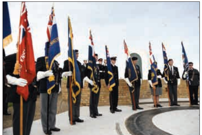
Standards at Newhaven

Please advise the Director (07740 243963) if you intend to come to either event.