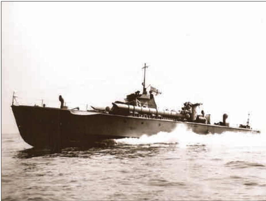
MTB 1939 White 72ft

It is good to be able to report growing support for this newsletter and to record the thanks of the Trustees for your donations. Please keep them coming! As a matter of interest, supporters may wish to know that, in addition to a healthy distribution within the UK, copies of this Newsletter are also read by supporters in Australia, Bermuda, Canada, Croatia, France, Hong Kong, Holland, Norway, South Africa, Spain and the USA.