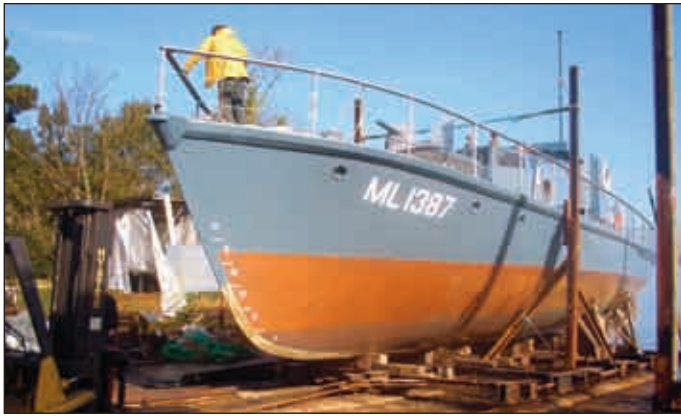
Ready on the slip