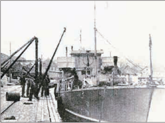
Unloading at Lysekil

radar stations on both sides of the gap, there were extensive minefields, the enemy had command of the air for most of the 500 miles involved, and they had Fleet destroyers based both in Denmark and Norway. On arrival in Sweden the converted MGBs would be under the constant eye of enemy agents and diplomats who would report their every move. And with relatively frail craft heavily loaded on the home run, in winter, in the North Sea, there were bound to be major mechanical problems to be overcome, sometimes in horrendous conditions. And finally there were large fishing fleets on both sides to be circumvented. Perhaps their only advantages were their speed, their shallow draught and the fact that the Swedes, at this stage of the war, could be expected to lean more towards the Allies than the Axis. When weather and operational conditions allowed they could also expect friendly air cover to escort them home from the middle of the North Sea.