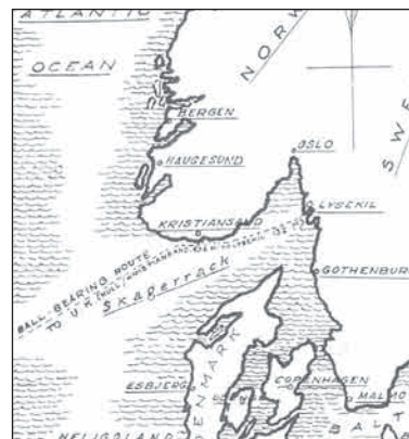
LEFT Ball Bearing Run

Ensign with Merchant Navy crews, which also had the benefit of being less embarrassing to Sweden if things went awry.