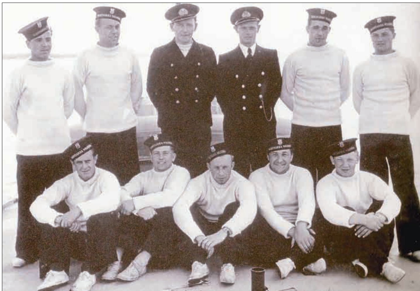
Capt Whisky and crew