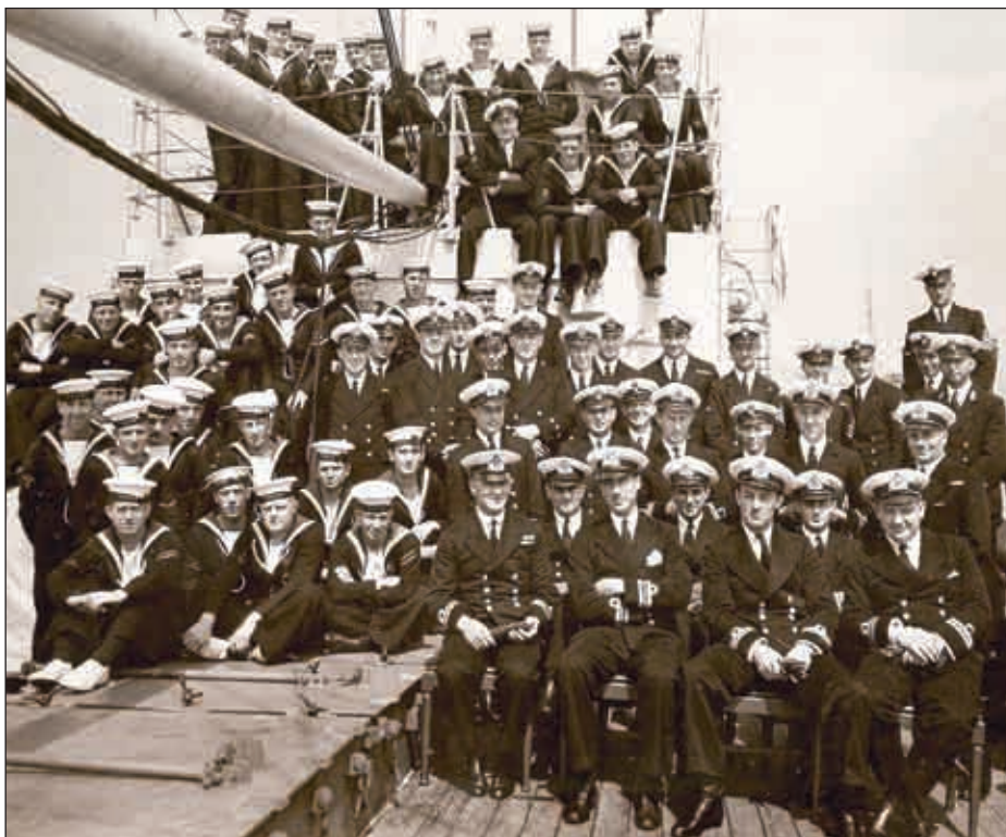
Flotilla Ships' Companies

At just after 0800 the next morning, after a night at 24 knots aided by a following wind and sea, near disaster threatened when MTB 5 struck a submerged object, believed