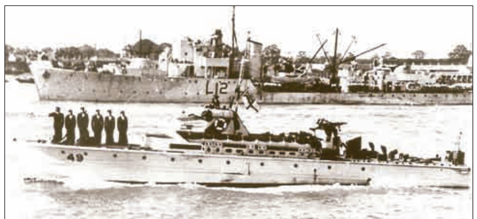
RIGHT MTB 1939 Thornycroft 74ft