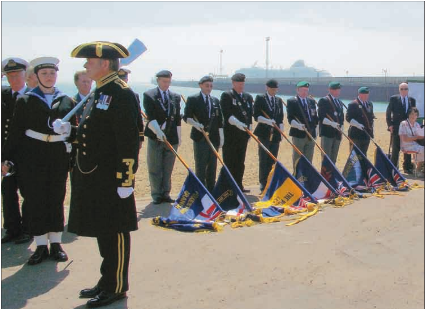
'We will remember them'