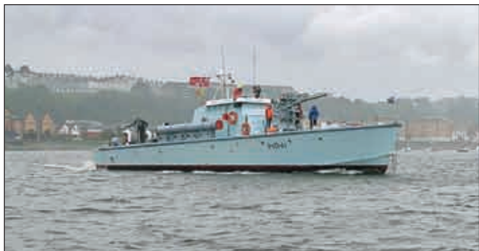
Gay Archer off Cardiff