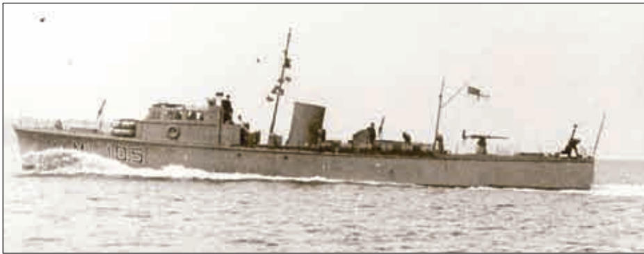
ML 1939 Fairmile A 110ft