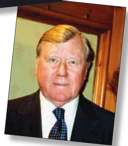
BELOW Sir Derrick Holden-Brown