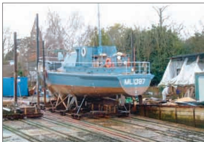
Medusa saved from the ashes