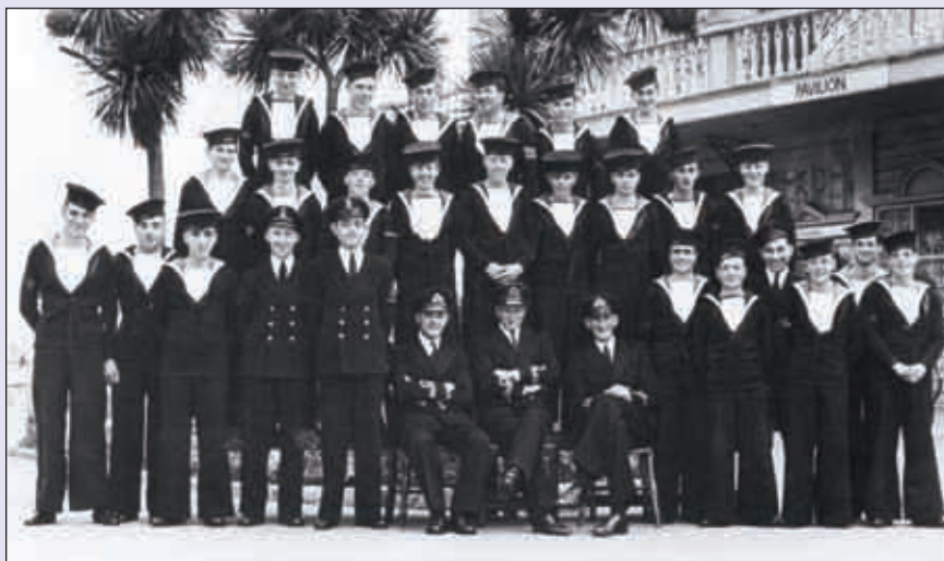
The crew of MTB 602, Weymouth, August 1943

We then sought daytime shelter in a bottle-necked cove on the island of Ist, where we secured between the sunken schooner and a jetty, with camouflage nets over all. Here we had an engine breakdown and so the other boat went on alone to complete the operation that night. She returned successfully early the following morning and we settled down for a second day under camouflage. It was this day the hospital ship appeared, and although we wondered if she was illegally carrying troops, we could only have used depth charges in an attack, our other armament being too light against such a target. We both returned safely to Vis the following night."