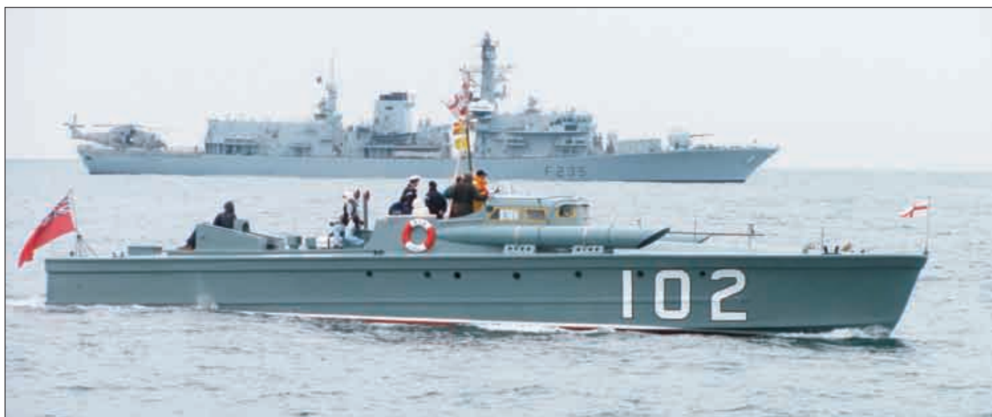
102 and Monmouth