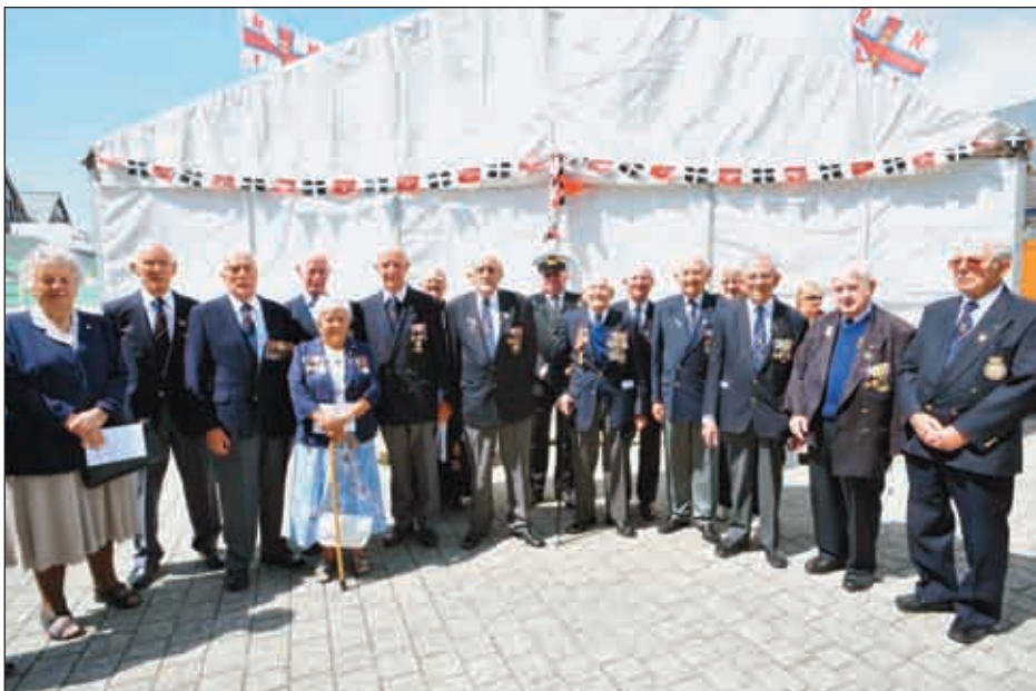
LEFT Great Veterans turnout!